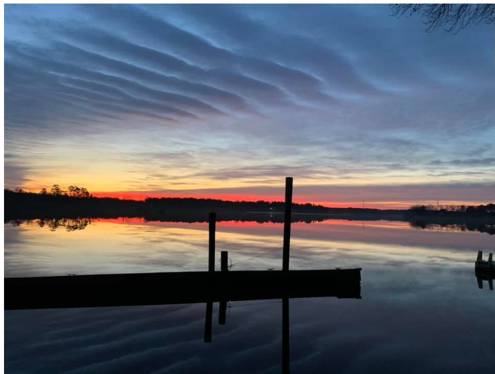
Sunrise on the Great Egg Harbor River, Mays Landing, NJ